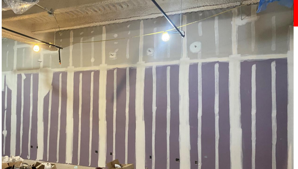
Gypsum Board Wall Progress 1 st Floor of New Addition