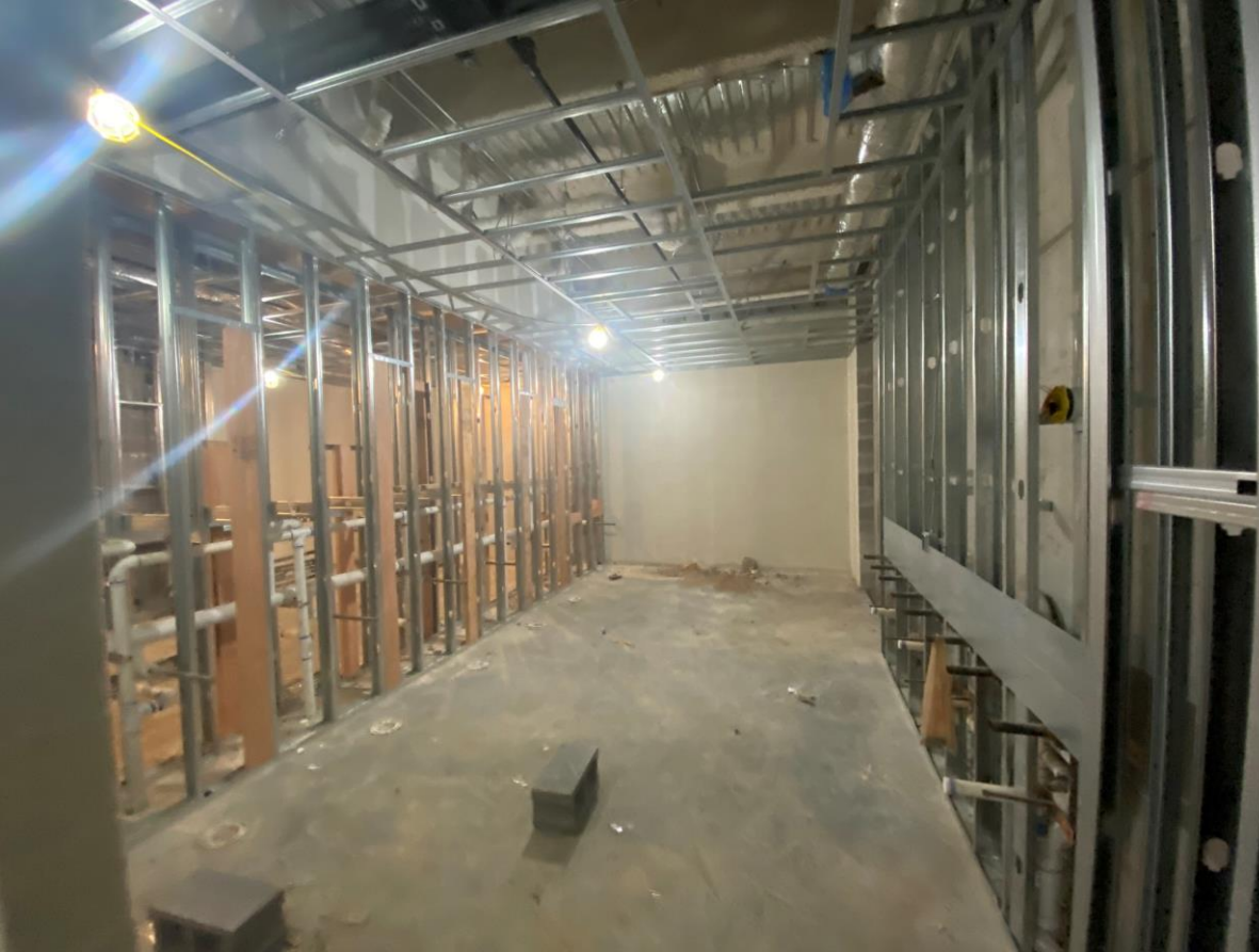
Metal Framing Progress in Restroom