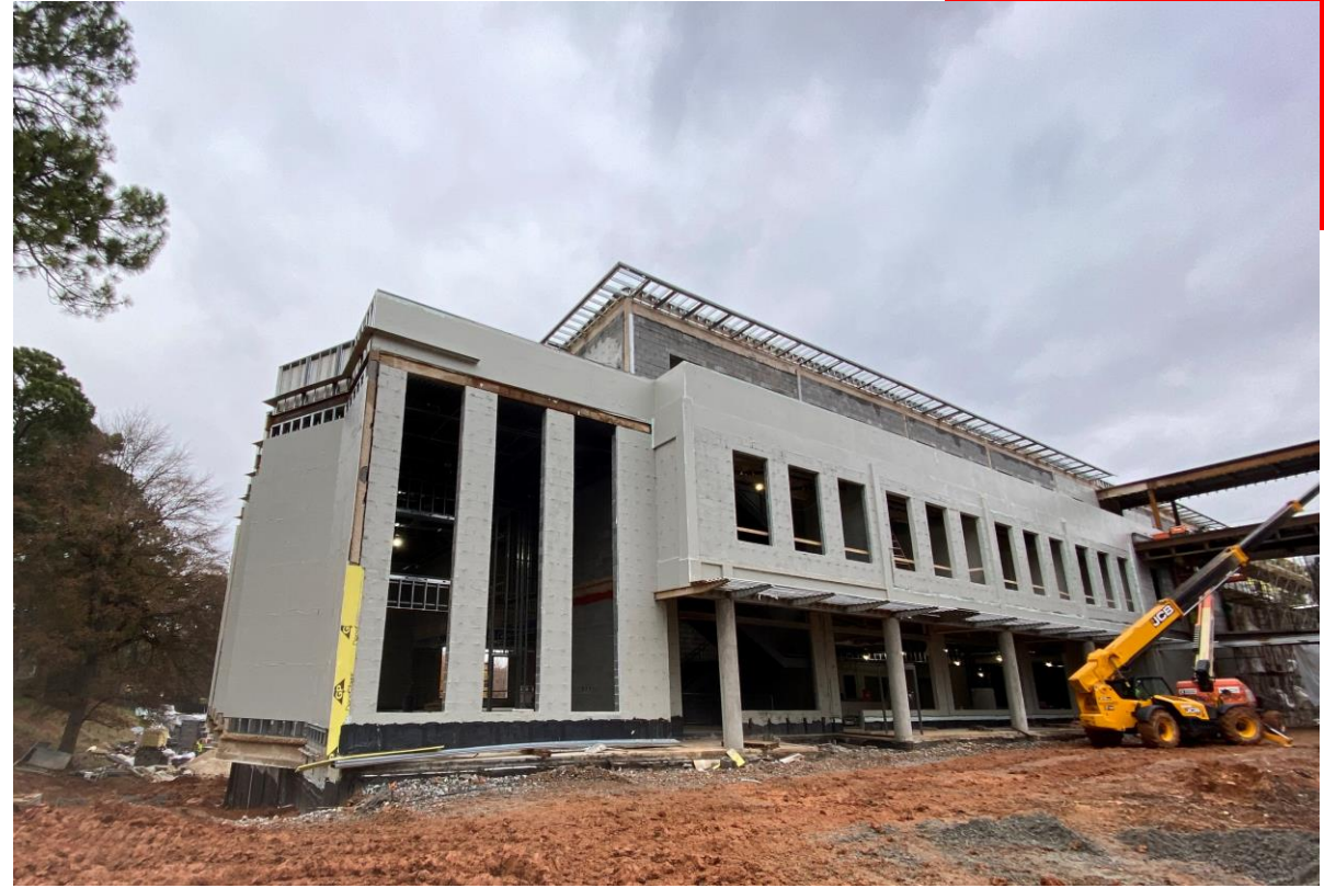
New Addition Progress – South Elevation