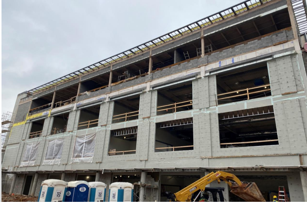
New Addition Progress – North Elevation