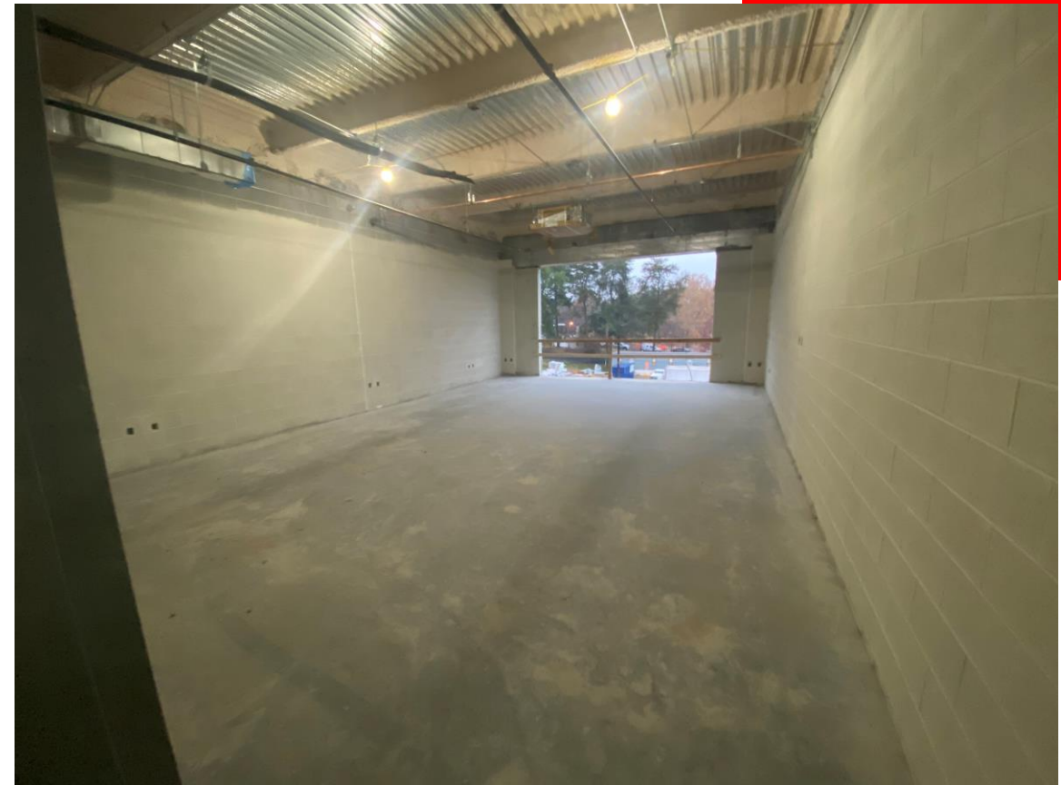
Block fill Completed on 3 rd Floor of New Addition