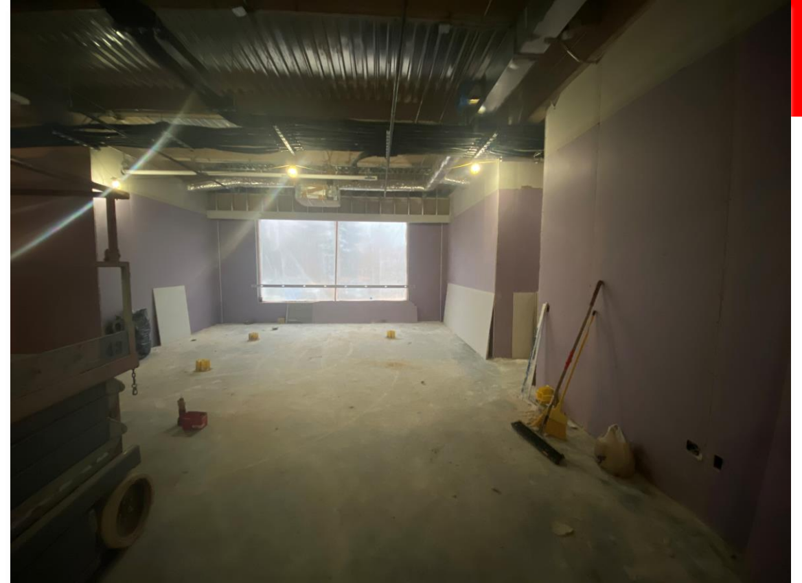
Counseling Area Progress