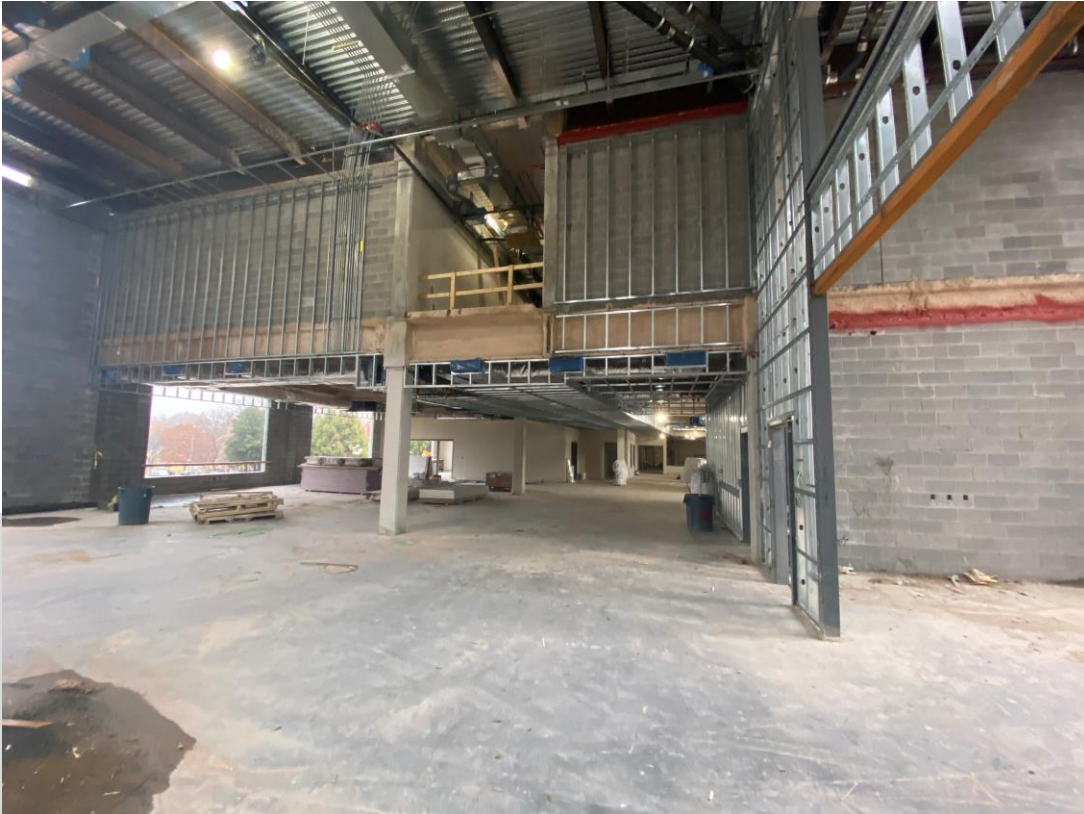
Metal Framing Progress in Media Center